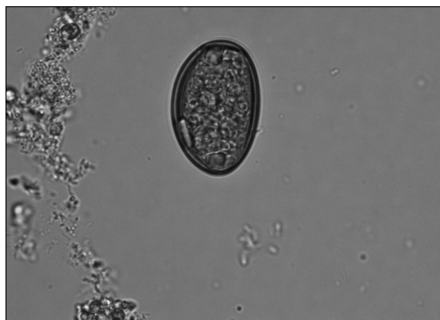
Figure 2) Dicrocoelium dendriticum egg ( \times 1000 magnification, wet mount preparation, original magnification). Eggs are small ( 20\ \mu\text{m} \times 35\ \mu\text{m} to 50\ \mu\text{m} ), thick-shelled and dark brown in colour

The dose of azathioprine was increased to 125 mg/kg/day (2 mg/kg) and infliximab was infused intravenously (5 mg/kg), and repeated two and six weeks later. Review at that time revealed that he felt much better, had two formed bowel movements per day and had gained 3.2 kg.