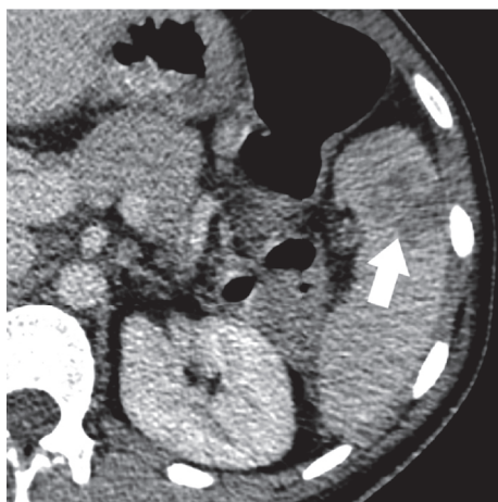
FIGURE 2: Axial contrast enhanced CT image demonstrating a heterogeneous splenic abscess (thick arrow).

3.1.2. Case Two. A 27-year-old woman presented to hospital with fever, abdominal pain, chest pain, and weight loss. Past medical history was of UC diagnosed at age 26, treated with prednisone and azathioprine, for which she was nonadherent and ceased therapy. At the time of presentation, she described four days of left-upper quadrant abdominal pain and pleuritic chest pain radiating to her left shoulder. There was fever, oral ulcers, a 10 lbs weight loss, and arthritis of the hands, elbows, knees, and ankles. She had an elevated WBC count ( 21.1 \times 10^3 cells/ \mu L), neutrophil count ( 16.0 \times 10^3 cells/ \mu L), CRP (112 mg/L), and ESR (88 mm/hr). Abdominal CT scans revealed an enlarging heterogeneous abscess measuring 3.7 \times 4.0 \times 2.4 cm initially and 4.2 \times 3.6 \times 2.6 cm 3 days later (Figure 2).