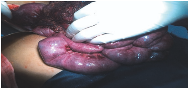
FIGURE 2: Gross specimen showing patchy ischemia of small intestine, peritoneum, and omentum from patient having gastrointestinal and peritoneal ischemic disease.

of the patients are from Chenchaworeda while the rest are from Bonke woreda. All patients were presented as acute abdomen. Abdominal pain, vomiting, and abdominal distension were presenting symptoms in all cases (Figure 1). Six of the cases presented with hypovolemic shock. Three of the cases presented with tachypnea, with average pulse rate of 119 \pm 25.83 bit/minute and average respiratory rate of 36 \pm 8.25 breath/minute. Only two of the cases had objective fever with axillary temperature of >38^\circ\text{C} and average temperature of 37.47^\circ\text{C} \pm 1.2 SD on presentation.