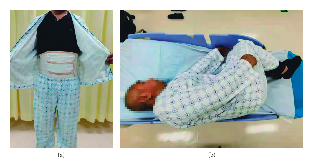
FIGURE 1: The use of the abdominal bandage.