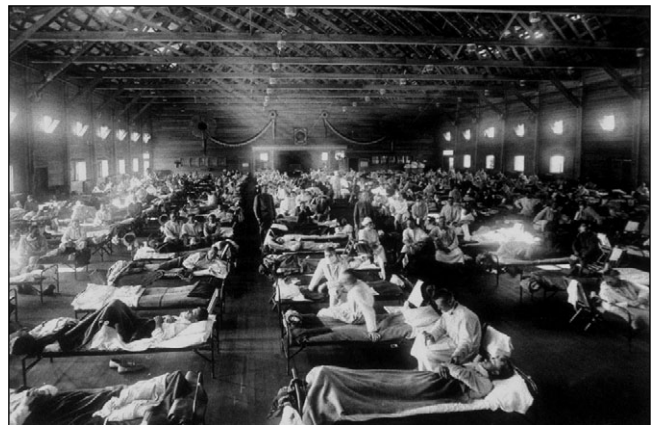
Figure 1) The influenza pandemic of 1918. Reproduced/adapted with permission from reference 20

The first pandemic of the 1900s was caused by Spanish influenza, which circulated worldwide between 1918 and 1919. Over