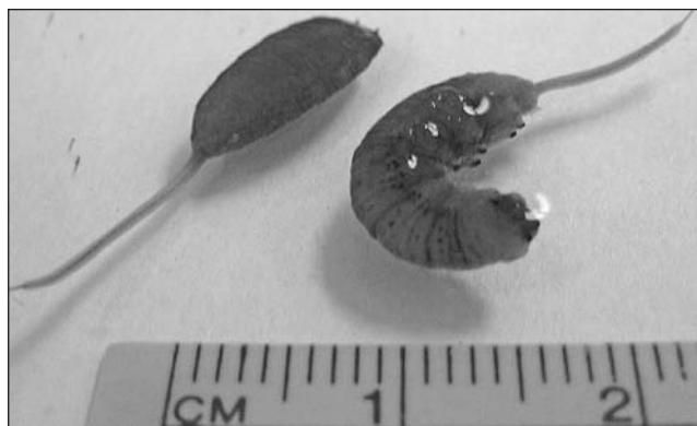
Figure 1) Rat-tailed Eristalis larvae