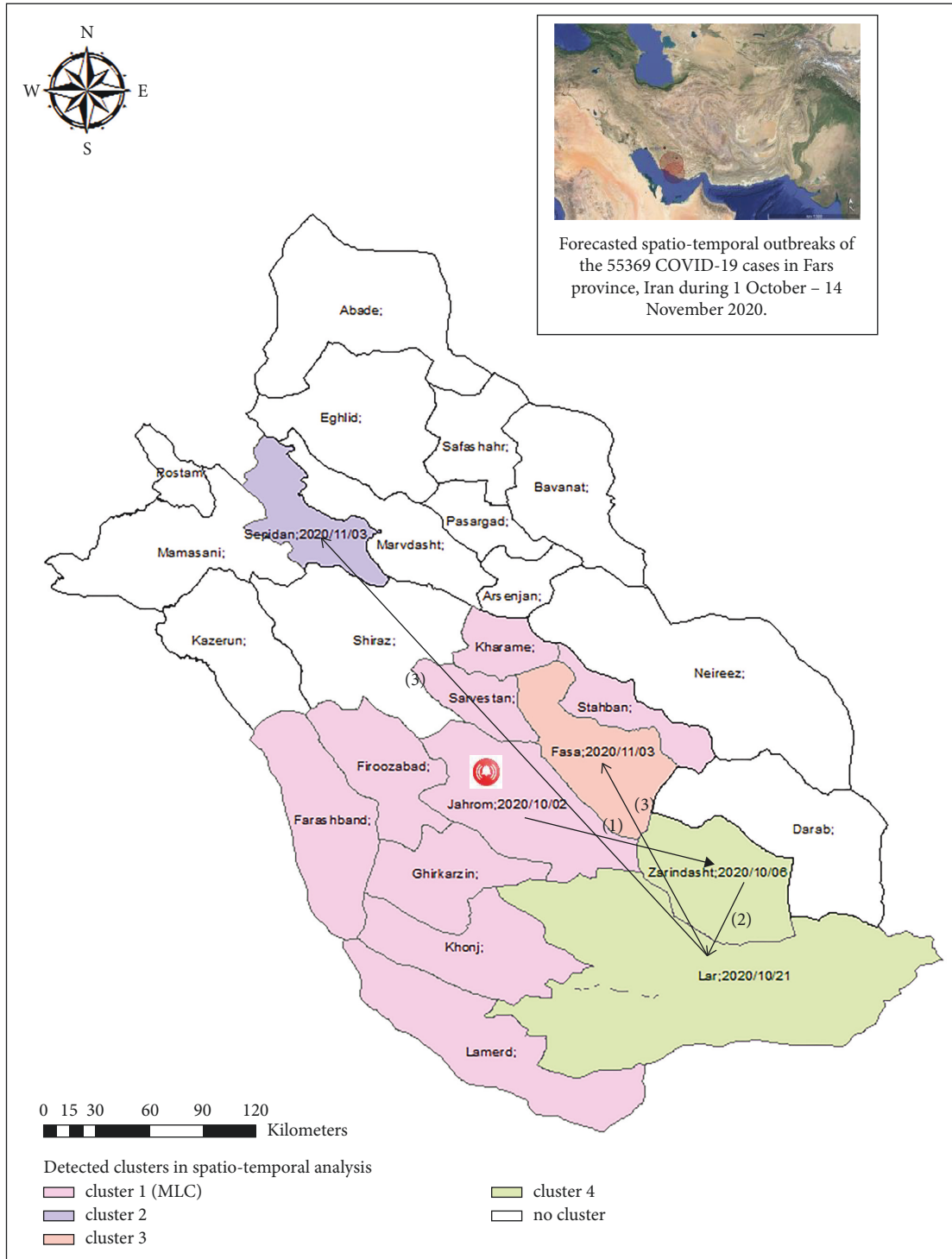
FIGURE 3: The progression of COVID-19 epidemic in Fars province, Iran during 1 October–14 November 2020.

was not included in the predicted outbreaks. Shiraz was ignored in permutation scan statistics analysis, in which clusters are ranked by their likelihood ratio scores rather than by the population density or the area size. This can be attributed to the fact that, with the capital city of Fars province being with advanced medical services, many patients from nearby cities travel to Shiraz to receive health