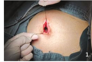
FIGURE 1: Make a longitudinal incision of 2-2.5 cm in the umbilical region.

All 8 cases were treated with flurbiprofen axetil injection 50 mg intravenous drip. It is used for analgesia twice a day