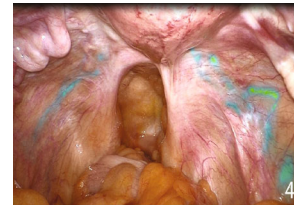
FIGURE 4: Developed lymphatic vessels.