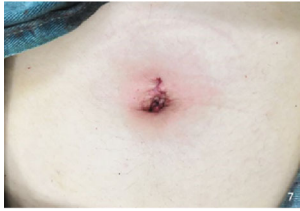
FIGURE 6: Suture of novel incision at the end of the operation.