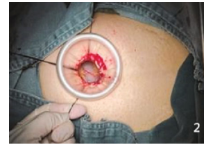
FIGURE 2: Incision protective cover to open the incision.