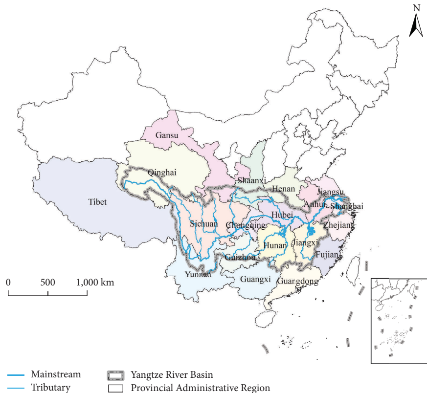
FIGURE 1: Overview map of YRb.

flood storage and environmental purifying functions of the YRb and intensified the threat of floods [3]. It is recorded that the 1990s was a decade of frequent floods in the YRb following the 1950s [4], and the economic losses were multiplied for the same flooded area due to the growth of the economic aggregate. As can be seen from the flood damage (FD) statistics from 1978 to 2019 in Figure 2, in addition to the obvious decreasing trend in the number of flood deaths, floods in the YRb have also led to increased direct economic losses with large interannual differences, among which the direct economic losses in 1998, 2010, 2013, and 2016 were more than CNY 200 billion. During the time period of the FD statistics, although the annual change curves of the affected population and crop area were basically inverted U-shaped, they did not show a significant slowing trend until after 2010. As a result, while the YRb is booming, the flood has gradually become one of the serious natural disasters, threatening public safety in the YRb. In the future development period, further studies on the causes of floods and flood management in the YRb will become important tasks to ensure the sustainable development of the YRb.