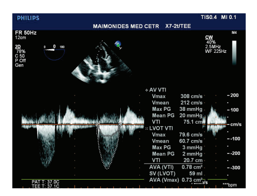
FIGURE 3: TEE image of the deep transgastric long axis (Deep TG LAX) view measuring the gradient through the aortic valve and LVOT (two of three measurements used to calculate the aortic valve area using the continuity equation).

placenta. One of the biggest changes during pregnancy is the increase in cardiac output secondary to an increase in heart rate and stroke volume, up to a 75% increase above prelabor values (Table 1). These normal physiological changes of pregnancy can precipitate heart failure in patient with severe AS. The increase in cardiac output and blood volume attributable to uterine contractions during labor, in face of the fixed stroke volume of aortic stenosis, may precipitate tachycardia. Tachycardia is worsened further by the pain-induced sympathetic stimulation and acute decompensation can set in.