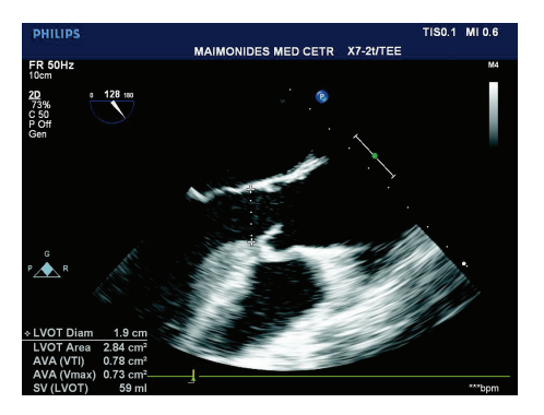
FIGURE 2: TEE image of the midesophageal aortic valve long axis (ME AV LAX) view measuring the LVOT diameter (one of three measurements used to calculate the aortic valve area using the continuity equation). LVOT = left ventricular outflow tract.

The NICU staff was present for the delivery and the baby was taken to the NICU for close monitoring. The initial APGAR score was 2 and the baby was floppy and apneic. After initial positive pressure ventilation, the baby was intubated. APGAR scores quickly improved to 5 and then 8 at which point the baby was extubated. The baby was observed in the NICU for a few days with an initial diagnosis of respiratory distress. The baby was treated with C-PAP for one day and the diagnosis of apnea and transient tachypnea of the newborn baby of a diabetic mother was made. Chest X-ray was unremarkable and, after one day on IV glucose solutions, the baby was able to maintain normal glucose levels. The apnea improved and the baby was discharged to the nursery on day 4.