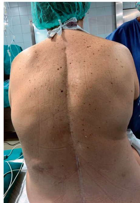
FIGURE 2: Image of the back in which the scar is seen on the spinous process in the thoracic and lumbar region, as well as the projection corresponding to the implant zone of the neurostimulator.

Intraoperative monitoring included electrocardiogram, SpO 2 monitoring, noninvasive blood pressure (BP) assessments every 5 minutes, bispectral index (monitor integrated in the Primus® anesthesia station, Drägerwerk AG, Lübeck, Germany), and nociception level index (NOL index) assessments (PMD-200® monitor, Medasense Biometrics Ltd, Ramat Gan, Israel).