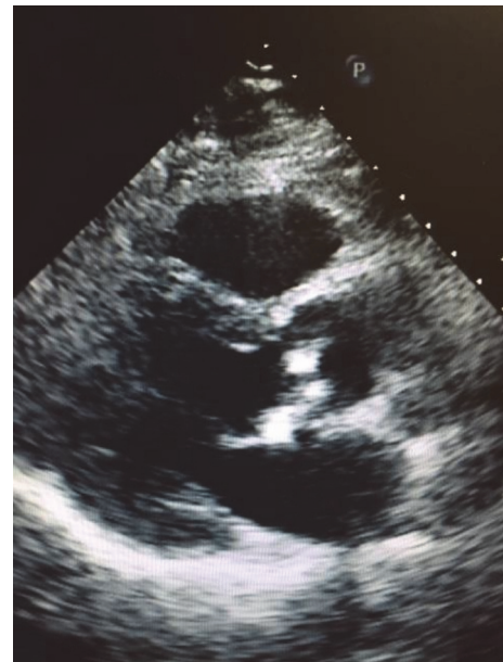
FIGURE 4: Aortic stenosis with calcified leaflets.