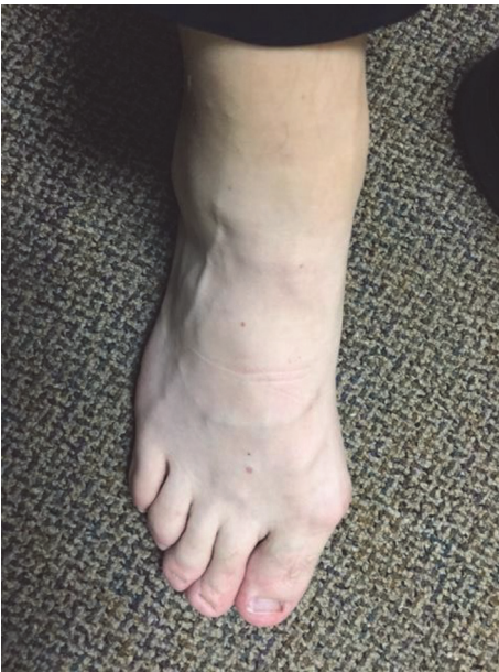
FIGURE 2: Hallux valgus.