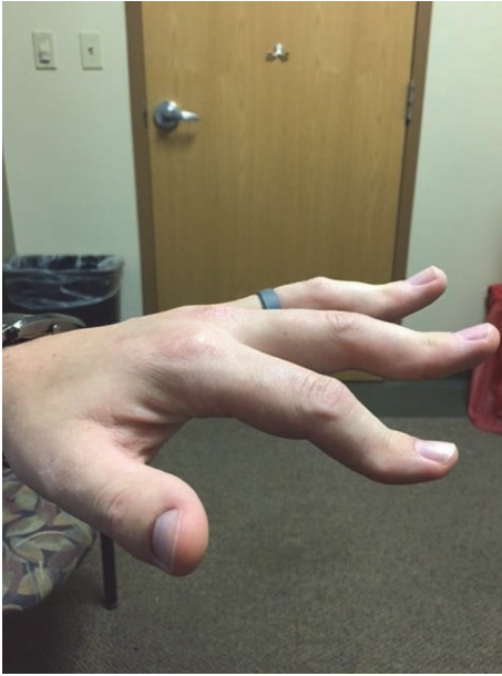
FIGURE 1: Hand deformities.