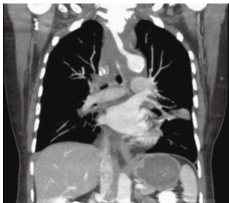
FIGURE 1: CT scan demonstrating ill-defined fluid collection in the superior mediastinum (arrow).

Judkins Right 4 catheter was used to engage the right coronary artery system. The procedure was completed without difficulty from the operator, and the patient was transferred to the postoperative holding area in stable condition.