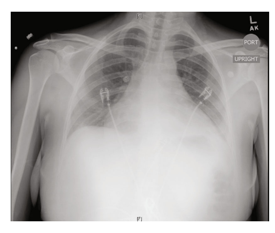
FIGURE 2: Enlarged cardio-mediastinal silhouette.

bacterial and viral cultures, and ANA, which only revealed elevated Coxsackie titers. For her recurrent disease with high-risk features, defined by tamponade and myocardial involvement, she was initiated on a combination of ibuprofen, a short prednisone taper, and 6 months of colchicine therapy.