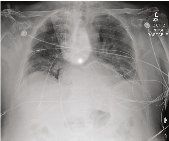
FIGURE 3: CXR on initial presentation.