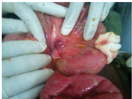
FIGURE 2: The corresponding mesenteric hematoma.

symptom together with absence of bowel sounds occurring in over 64% of cases [7] which should alert the clinician of such significant injury. Clinical presentation and physical examination alone are often not sufficient to make a diagnosis, and reliance on radiological investigations such as chest and plain abdominal X-rays (erect and supine) becomes important first-line tests in resource-constrained settings. However, in a study by Saku et al. [21] only 8% (1 out of 12 patients) of patients with bowel perforation after trauma evaluated, demonstrated free air under the diaphragm on chest X-ray as compared to 92% (11 out of 12 patients) in whom extra luminal air was detected readily by CT scan. There have also been reports that left lateral decubitus X-rays may better clarify where CXR have failed. However, this was not carried out for our patient. The use of DPL, FAST, and abdominal CT scan therefore add significantly to the precision in diagnosis and early intervention for improved outcomes [10]. Although CT scan is the gold standard for assessment of blunt trauma [7], DPL still has some diagnostic value [22–24]. Ultrasound is poor in diagnosing bowel pathologies due to presence of gas.