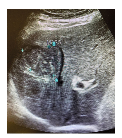
FIGURE 1: Ultrasound liver showing the heterogeneous mass suggestive of abscess.