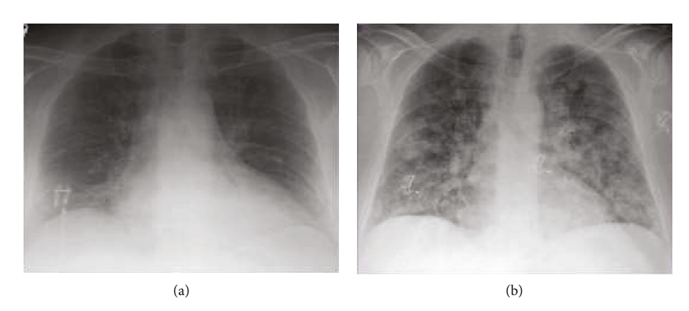
FIGURE 1: (a) Approximately 24 hours prior to the development of diffuse pulmonary hemorrhage. (b) After the development of severe cough and hemoptysis which required airway protection through intubation.

eventually intubated for airway protection (Figure 1). The patient's platelets decreased from 370k to 5k within 12 hours. It is worth noting that the patient was treated with eptifibatide during his initial catheterization 5 days prior as well, with no complications. Due to his acute profound thrombocytopenia and persistent hemoptysis, the patient received 1 unit of platelets; the Ticagrelor and eptifibatide were discontinued. Soon after, his platelets began to rebound. In addition, the patient was extubated the following morning. The patient did not require further intervention, made full recovery, and was discharged 9 days later.