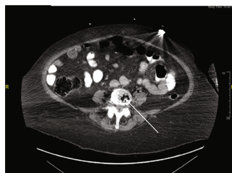
FIGURE 2: CT abdomen and pelvis showing pneumoracchis.

patient's medical history was notable for hypertension, diabetes mellitus, and sciatica.