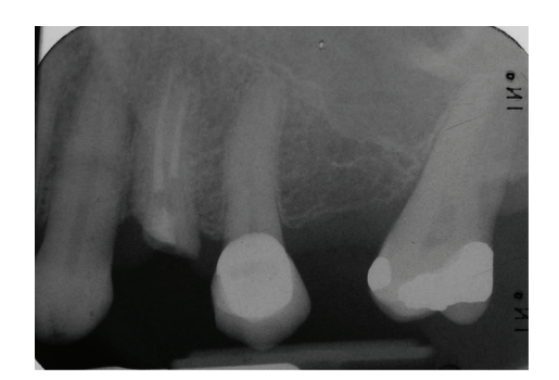
FIGURE 2: Periapical radiograph of UL4 shows intact root fillings, oblique fracture and a healthy root.

be healthy with normal probing depth. The tooth was asymptomatic, and no periapical pathology was seen. UL3, UL5 were healthy teeth with normal mobility though UL5 has a bonded porcelain crown (Figures 1 and 2).