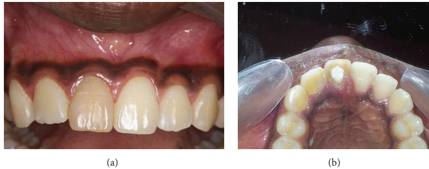
FIGURE 1: (a) Labial view. (b) Palatal view.

retardation of focal group of cells (Kronfeld 1934), external forces (Atkinson 1943), trauma (Gustafson & Sundberg 1950), infection (Fischer 1936), and genetic factors as reported by Hülsmann, Alani, and Coriani [2, 3, 6].