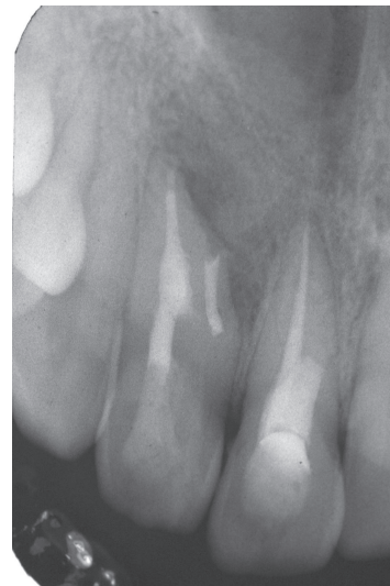
FIGURE 6: 1-year postoperative IOPA.