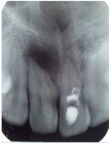
FIGURE 2: Intraoral periapical image.