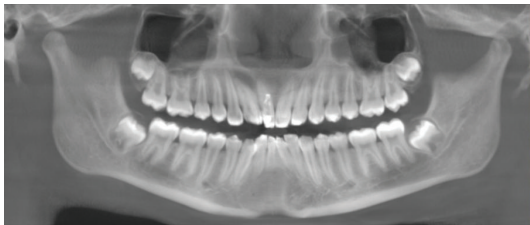
FIGURE 3: OPG.

examined with Carestream 3D Imaging software (Atlanta, GA, USA).