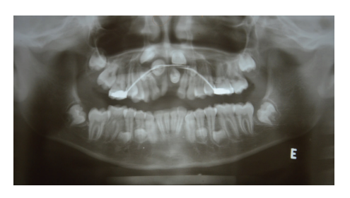
FIGURE 3: Orthopantomogram. Nine supernumerary teeth distributed in the maxillary and mandibular arches.

The analysis of the orthopantomogram and occlusal radiographs revealed the presence of nine impacted supernumerary teeth in the four quadrants, distributed as follows: in the maxilla there were one conical and two tuberculate mesiodens and two supplemental teeth in the posterior segment. In the mandible, there were four tuberculate teeth arranged in the premolar region, two in the right side and the other ones on the left side (Figure 3). The cone-beam