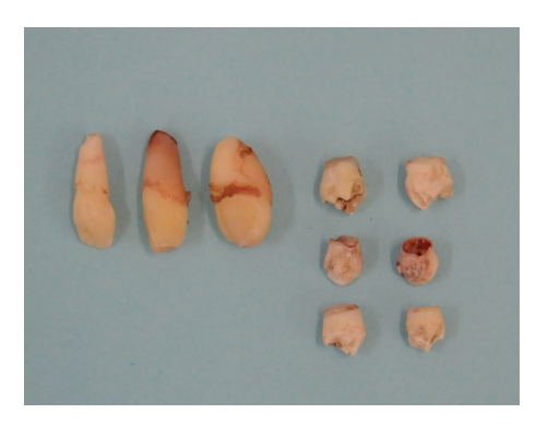
FIGURE 4: Nine supernumerary teeth.

computed tomography showed that the central incisors were arranged horizontally in the floor of the nasal cavity and presented a complete root development.