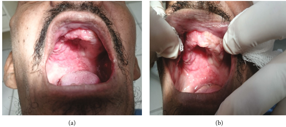
FIGURE 1: Clinical aspect of intraoral lesions in the palate and alveolar ridge regions (a, b).