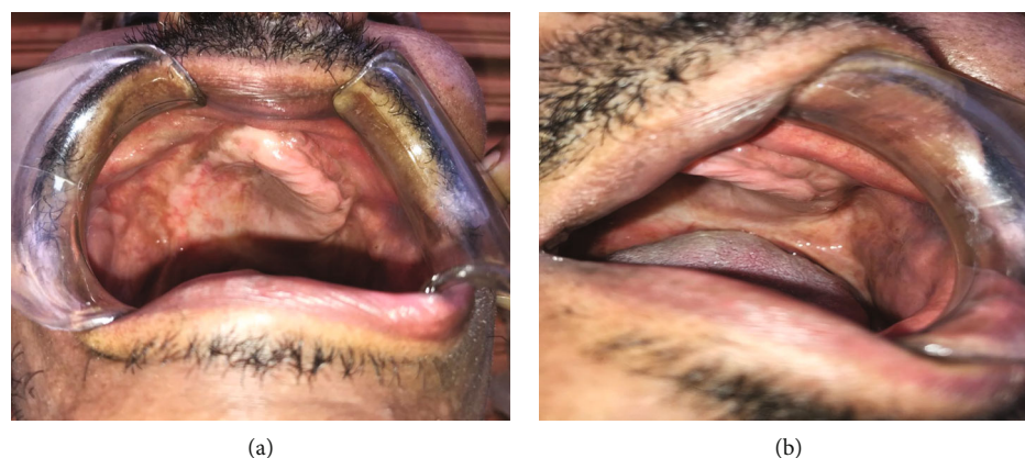
FIGURE 3: After twelve months, the clinical regression of oral histoplasmosis lesions.

characteristics of H. capsulatum . In addition, the immunohistochemical reactivity to Histoplasma using polyclonal antibody was positive; for polyclonal P. brasiliensis , Leishmania spp. and Calmette-Guérin bacillus were negative. The diagnosis of oral histoplasmosis was established. We did not search for fungi in other biological samples.