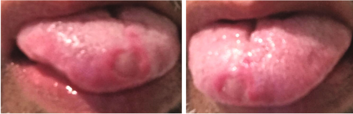
FIGURE 1: Ulcerative lesion with red halo on the dorsum surface of the right side of the tip of the tongue.