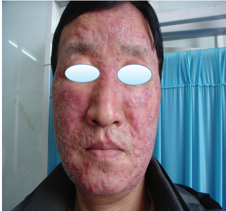
FIGURE 1: Erythema, papule and nodules, and desquamation over the whole face.