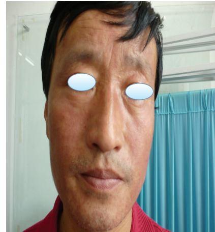
FIGURE 3: The lesions completely disappeared.

In our report, the patient had no history of trauma such as shaving of the face or previous cutaneous fungal infections and had no immunosuppression; in that way what is the initiating factor? Immunosuppressive drugs include corticosteroids, vincristine, cyclophosphamide, azathioprine, and tacrolimus, alone or in combination. Jacobs [11] thought that misapplication of topical corticosteroids over a long period can produce Majocchi granuloma. It was reported that MG was made by applying betamethasone ointment for 4 months by Meehan [12]. When it occurs to the patient, it might be eczema or allergic diseases at first, and he consulted doctors in private clinics and was given topical corticosteroids over a long time; then the host was occasionally infected by dermatophytes; the application of corticosteroids initially