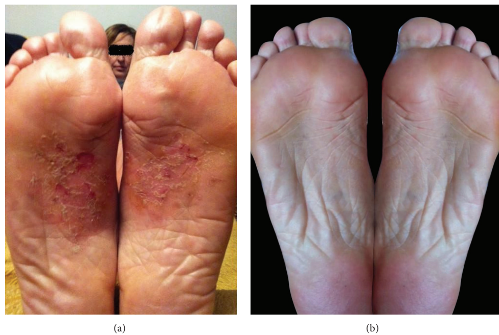
FIGURE 1: (a) Foot dermatitis before diagnosis of Toxocara infections. (b) Foot dermatitis after antiparasitic treatment.