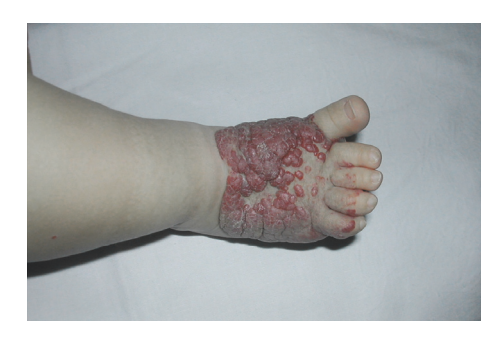
FIGURE 4: Case 4. Pebbled patches of bright-red hemangioma and the distal part extending onto the digits presenting reticulated network-like telangiectasia morphology.