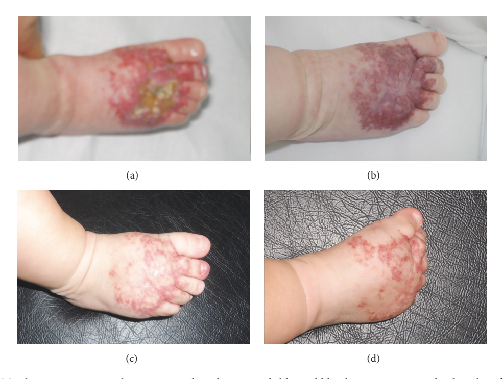
FIGURE 1: Case 1. (a) Ulceration on an erythematous patch with a network-like and blotchy appearance in the dorsal surface of the foot of a boy of 3 months. (b) Resolution of the ulceration after 1 month with propranolol treatment. Progressive regression of the lesion at 9 months (c) and 11 months (d).

digits but not to the distal tip (Figure 1). He was born full-term weighing 3240 g, the result of the mother's second pregnancy and an eutocic delivery. The lesion did not proliferate but he was referred to our centre at 3 months of life for a deep ulceration within the erythematous patch. The ulceration did not respond to topical and systemic antibiotic and it produced an important pain. So, a skin biopsy of 5 mm was carried out and the histopathology revealed ectatic vessels in the dermis without lobular pattern. Endothelial cells of these vessels were positive for anti-Glut-1 immunostaining compatible as abortive hemangioma. We initiated treatment with propranolol (3 mg/Kg/day) and the patient presented a good response. The ulcerative lesion healed and the erythematous patch started an involutive evolution without complication.