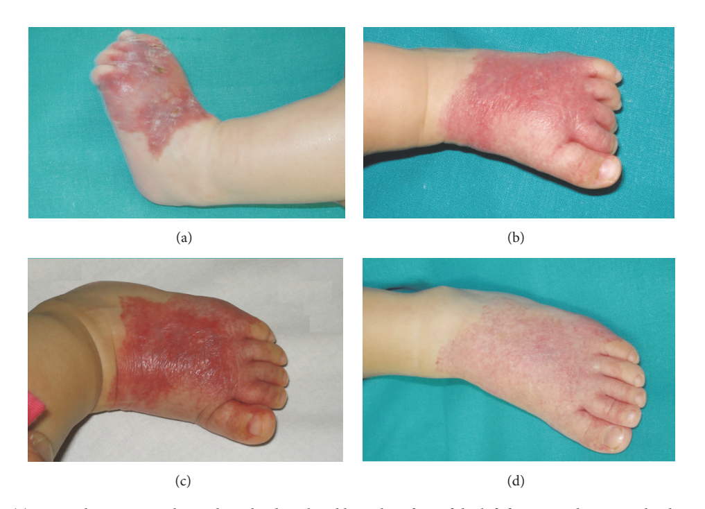
Figure 3: Case 3. (a) An erythematous scaly patch in the dorsal and lateral surface of the left foot extending onto the digits which presented multiple and superficial ulcerations. (b) Response to propranolol after the first month of treatment. (c) Response to propranolol at sixth months of treatment. (d) Spontaneous involution.