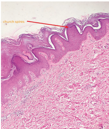
FIGURE 5: H&E stain with 10 \times : focal areas of hyperkeratosis, papillomatosis, and acanthosis with church spire appearance in AKVH.

reticulum [5]. A defect of SERCA2 leads to a deficiency of \text{Ca}^{2+} at the cell membrane, resulting in impaired cell-to-cell adhesion and apoptosis [5, 9]. The prevalence of this disorder in the population is 1:100,000. The sex incidence is equal, although the males appear to be more severely affected than females [10].