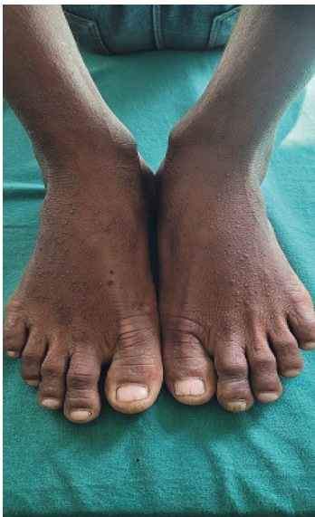
FIGURE 2: Multiple keratotic papules over the dorsum of bilateral feet.