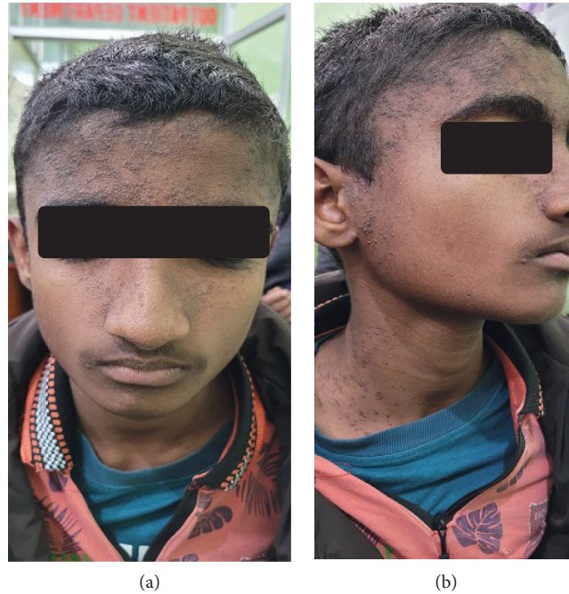
FIGURE 1: (a, b) Multiple flat-topped brownish verrucous plaques over the forehead, neck, and the periauricular area.