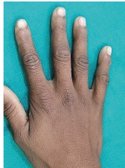
FIGURE 3: Multiple keratotic papules over the dorsum of the hand.

economic constraints, thus allelic similarities between the two could not be established.