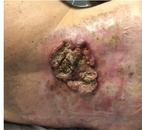
FIGURE 1: Exophytic ulcer 7-months after a thermic burn in the dorsal region. First patient visit to emergency department.

Malignant degeneration of a burn in the first 12 months since the acute lesion is something unusual. A review of the literature shows that the latency period between initial burn and subsequent malignancy can vary from 20 to 35 years, as shown in most series [5–7]. Xu et al. reported two Marjolin Ulcers arising over chronic foot wounds within 1 and 2 years, and Love RL presented one Marjolin's ulcer arising over a burn scar [8, 9]. There are very few cases with a very low number of patients reported in the literature about acute Marjolin's ulcers with such a fast development, even less about this disease over a recent burn scar, so describing new