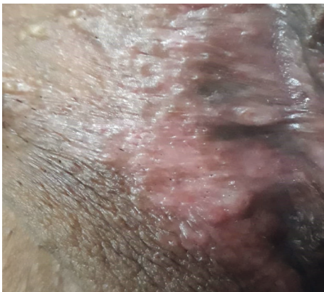
FIGURE 4: Remission after treatment by thalidomide.

The patient was visited every three months for physical examination and checking lab data such as complete blood tests, pregnancy tests, and kidney and liver function tests until the end of treatment; then, she was visited annually.