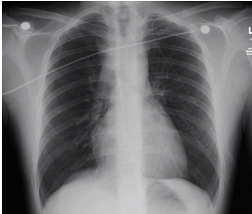
FIGURE 1: CXR on presentation.