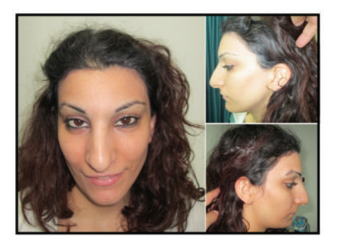
FIGURE 1: Frontal and profile views of our patient.

On the basis of her clinical presentation and facial features, array-CGH analysis was requested. Informed consent was obtained by the patient.