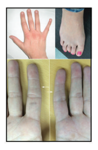
FIGURE 2: Hand and foot views. Note the curled toes and in particular the distinctive bilateral transverse creases involving the middle phalanx of the index finger (white arrows).

2.2. Cytogenetic and Molecular Analyses. DNA of the index patient and her parents was isolated from peripheral blood using the QIAamp DNA Midi Kit (Qiagen, Hidden, Germany) according to the supplier's protocol. Array-CGH (comparative-genomic-hybridization) was carried out using the Cytochip ISCA array (BlueGnome, version 1.0) with 180,000 oligos in a 4 \times 180 k format according to the recommendations of the manufacturer. Briefly, 500 ng of patient and pooled reference gDNA were differentially labeled using the Bioprime DNA Labeling System (Invitrogen, Carlsbad, CA) and the Cy3 and Cy5 fluorescent dyes (GE Healthcare, UK, Ltd.), respectively. Hybridization was carried out using an automated slide processor HS 400 PRO Hybridization Station (Tecan Inc., Männedorf, Switzerland). The array was scanned at 3 um resolution using the Agilent DNA microarray scanner (Agilent Technologies Inc., Santa Clara, CA, USA) and fluorescent ratios were calculated using the BlueFuse Multi software V4.2 (BlueGnome Ltd., Cambridge, UK). Fluorescence in situ hybridization (FISH) analysis was carried out on metaphase preparations using subtelomeric specific probes for the short (p-arm) and long arms (q-arm) of chromosome 10 (Cytocell, Cambridge, UK) according to the recommendations of the manufacturer.