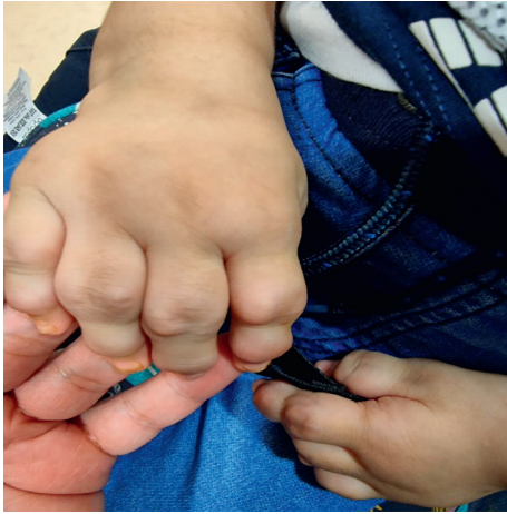
FIGURE 1: A picture of the patient's hands showing the swelling and deformities of the interphalangeal joints.

irregular borders of the distal metaphysis of metacarpals with scalloping of the distal ulna (Figure 2) were observed. Ultrasound of affected joints of the hands and feet revealed bulky hyperemic synovium and multiple foci of tenosynovitis without joint effusion. The working diagnosis at that point was juvenile idiopathic arthritis, so the patient was referred to Rheumatology service where he was commenced on multiple medications that were upgraded sequentially due to the lack of improvement, including systemic steroids and immunosuppressant medications. The biopsy that was taken from the subcutaneous nodules showed fibrosis, foamy macrophages, and chronic inflammatory cells without central necrosis.