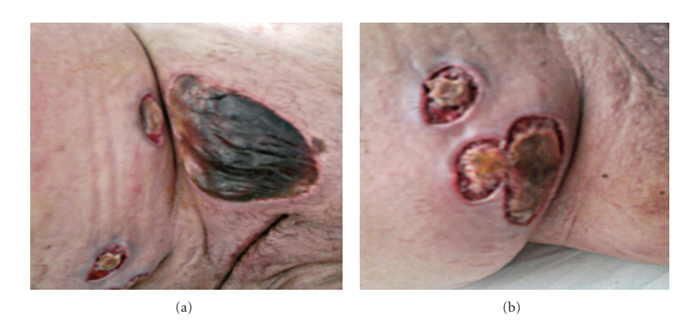
FIGURE 1: Skin necrosis in the d12 of induction daunorubicin-cytarabine.

treatment with ceftazidime, vancomycin, voriconazole, and aciclovir was instituted. Blood cultures were sterile. However, she remained febrile.