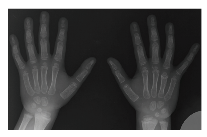
FIGURE 4: 3-year posttreatment radiographs showing discrete shortening of the right hand fourth metacarpal.

findings with mild abnormalities and the M.R.I. showing cortical destruction, diaphyseal and physeal involvement, and adjacent soft tissue oedema.