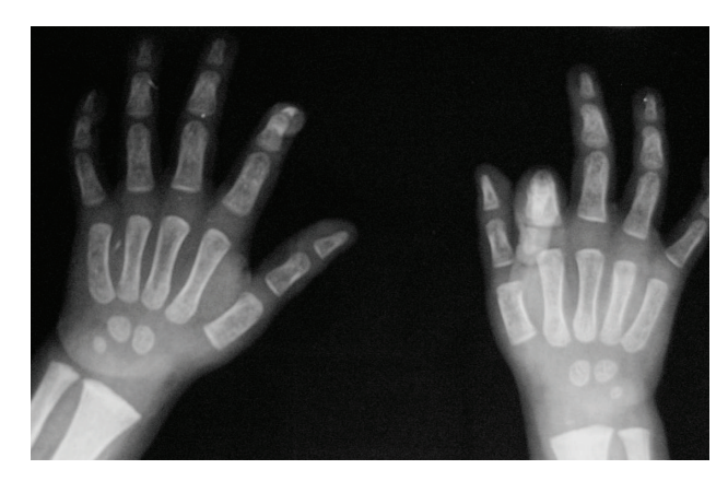
FIGURE 1: Plain radiographs showing little cortical hyperdensity of right hand fourthmetacarpal.