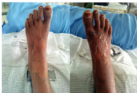
FIGURE 3: Desquamative rash on the feet of the patient.

As patient had been on immunosuppressive drugs for a long time it was postulated that the lack of immune response in the patient had caused this normally commensal microorganism to become pathologically invasive causing septicemia, a lung cavity, and an unusual rash. The rash on