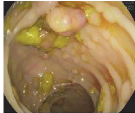
FIGURE 2: Colonoscopy demonstrating diffuse intestinal polyposis.

On hospital day 1, the patient's hemoglobin dropped from 10.2 g/dL to 8.3 g/dL, and he continued to have persistent and worsening anemia over the course of his hospitalization. He had no signs of GI bleeding on rectal examination, and laboratory workup was consistent with anemia of chronic disease. An endoscopy was performed that was negative for any signs of bleeding but did reveal multiple duodenal polyps. A polyp was biopsied with pathology demonstrating