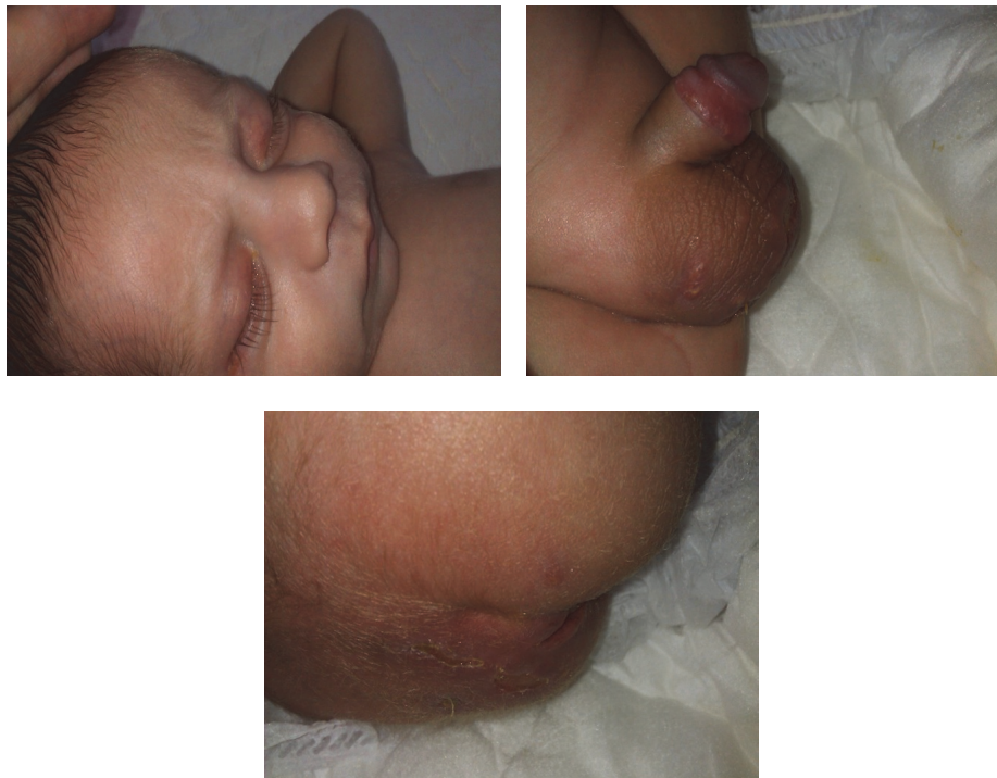
FIGURE 4: lesions after treatment.

then modified it to vancomycin and amikacin when culture results were available.