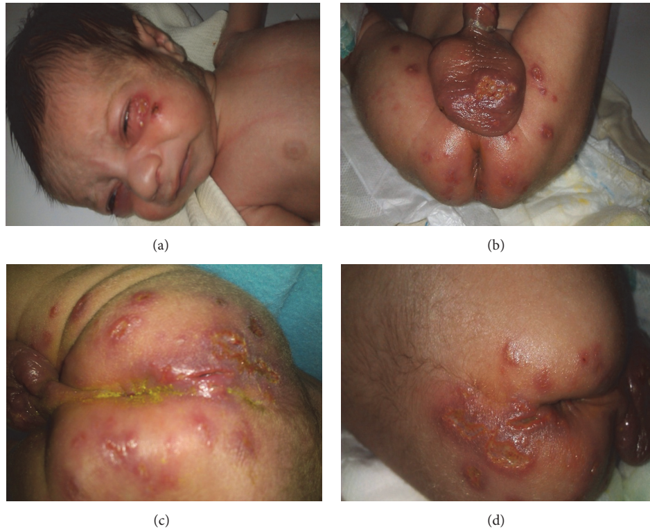
FIGURE 1: Vesiculopustular lesions ((a)–(d)).