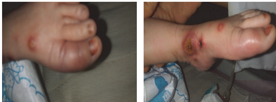
FIGURE 2: Dactylitis in the left foot.