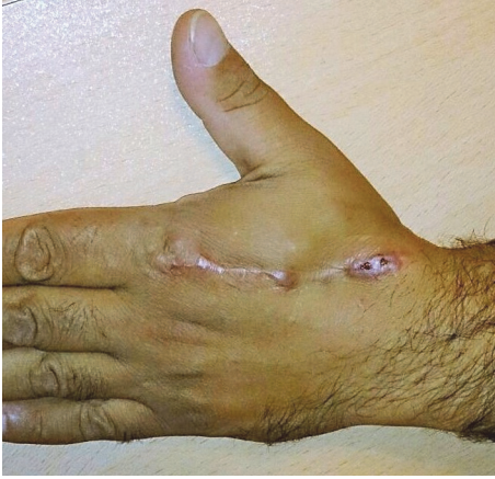
FIGURE 1: Swollen areas at the dorsum of the left hand and tender immobile nodules on the surgical scar.