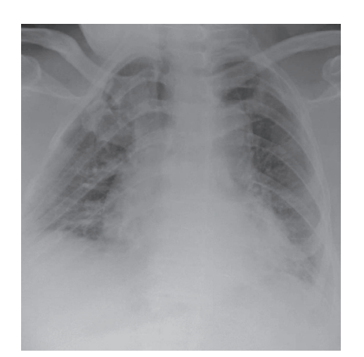
FIGURE 1: Cardiac silhouette is enlarged and vascular calcifications are present; increased central vascular lung markings; and no pulmonary edema, lobar consolidation, effusion, or pneumothorax.

relatively stable during the first forty-eight hours. On day 2 of admission, the patient remained stable and asymptomatic with no changes on physical exam. However, fifty-two hours after admission, he became febrile with a temperature of 101.7°F, and his oxygen saturation declined to 88% on room air and 92% via a 6 L nasal cannula. Notably, he was found to be diaphoretic but able to talk in full sentences. Physical exam revealed new wheezing sounds in the bilateral lung bases. Given his deteriorating conditions, it was decided to test the patient for COVID-19 given the rapid spread of the virus nationwide. Prior to this point, the patient did not have any of the typical criteria that were identified in current papers or guidelines from the Centers for Disease Control and Prevention, besides a low-grade fever. At this point, necessary samples were taken (respiratory viral panel, COVID-19, rapid strep, and throat culture) and appropriate isolation was initiated. Arterial blood gas was obtained while the patient was on room air, which showed 45% partial pressure of oxygen (PaO<sub>2</sub>) and 84% saturation. Due to concerns for additional complications including differential such as a pulmonary embolism, the patient was sent for a CT angiography of the chest (Figures 2(a) and 2(b)), which was negative for pulmonary embolism but did show findings consistent with COVID-19-positive patients [3-5].