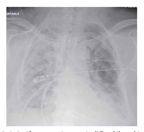
FIGURE 3: A significant gross increase in diffuse bilateral infiltrates with some sparing of the right upper lobe, which had worsened when compared to previous chest X-rays.

is mandatory to contain virus transmission [12]. Patients with mild disease should receive symptomatic relief. They should also be counseled on the potential of developing severe disease and of seeking urgent care in case symptoms worsen. This is also a recommendation for physicians as displayed by this patient who seemingly improved before rapidly declining. Oxygen therapy should be given immediately to patients with respiratory distress, hypoxemia, and shock. The target oxygen saturation should be >94% [12]. Patients will need close monitoring for signs of clinical deterioration. Management of critically ill patients with COVID-19 is considered when patients develop acute respiratory distress syndrome (ARDS). If ARDS develops, intubation should be performed.