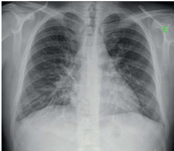
FIGURE 1: Chest X-ray performed on the 2 nd trip to the ER: bilateral perihilar reinforcement, erasure of both costophrenic sinuses, and diffuse interstitial infiltrate are observed.