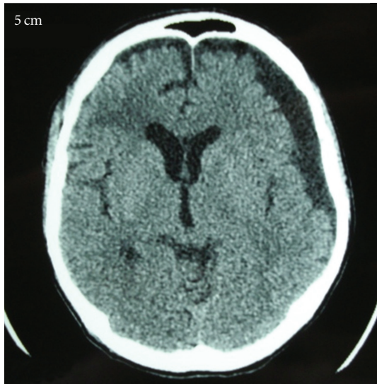
FIGURE 1: CT scan showing an increasing subdural fluid collection with mild mass effect and some effacement of lateral ventricle.