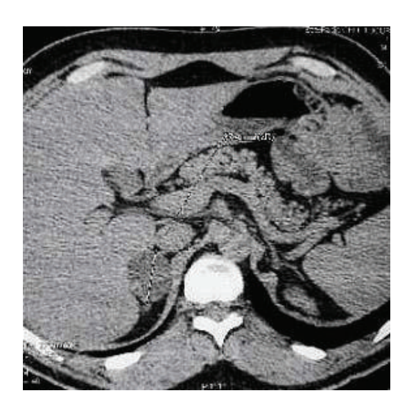
FIGURE 2: CT scan of the abdomen demonstrating a 2.5 \times 4.0 cm mass in the right adrenal gland.

FIGURE 1: Partial pedigree of the family and mutation segregation. Square and circle symbols represent male and female, respectively. The genotypes of the exon ii polymorphism are shown under the symbols. Arrow: proband. Grey symbols: asymptotic carriers of the mutation.