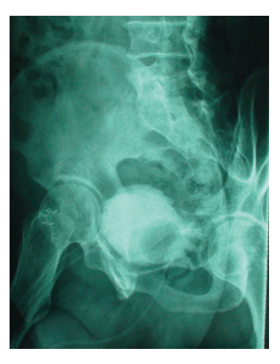
FIGURE 3: Postoperative oblique cystography with no extravasation.

An enterovesical fistula is a rare disease, with an estimated two to three patients per 10 000 hospital admissions and an annual incidence of 0.5 per 100 000 [2]. Clinical findings of RVF include urine leakage from the rectum, pneumaturia, and fecaluria [4–6]. The definitive diagnosis is clarified by visualizing the fistula tract and orifices by cystography and an endoscopic evaluation of the bladder and rectum.