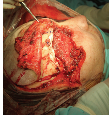
FIGURE 3: Orbitozygomatic approach. Tumoral resection and reconstruction with cyanoacrylate.

The first case of mesenchymal chondrosarcoma (MCS) was described by Lichtenstein and Bernstein in 1959 [5]. Approximately 10% occur in the head and neck region, being the maxillomandibulofacial skeleton the site in the head and neck where mesenchymal chondrosarcomas are most commonly encountered. Less commonly encountered sites in the head and neck include the sinonasal tract, orbit, and thyroid gland [1]. Our case is one of the approximately 30 cases already reported with localization in the orbit. This tumor tends to affect patients in their second or third decades of life, with a female preponderance [1, 6], something important to notice given that the patient herein described