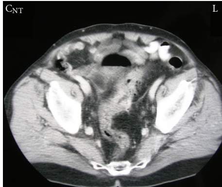
FIGURE 1: Transverse abdominal CT scan demonstrating airlevel into the urinary bladder closely in contact with a thickened segment of the sigmoid colon and colon diverticula.

identified; however, diffuse diverticula of the sigmoid colon with thickness, edema, and inflammation into the lumen were observed. No evident fistula tract was revealed.