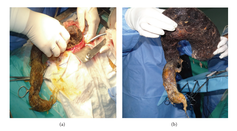
FIGURE 3: The trichobezoar has been extracted through the longitudinal gastrotomy (a). Specimen of the Rapunzel syndrome (b).