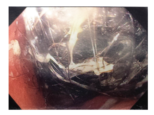
FIGURE 2: Endoscopic view of an intragastric trichobezoar.

computed tomography (CT) scan revealed a huge hypodense and heterogeneous gastric mass, appearing as a mesh, with multiple air bubbles seen within and surrounding the mass (Figure 1(a)). The mass filled the gastric fundus and duodenum and extended into the first centimeters of the jejunum. Finally, an upper gastrointestinal endoscopy was performed and revealed the presence of a giant trichobezoar, extending from the distal esophagus and occluding the pylorus (Figure 2).