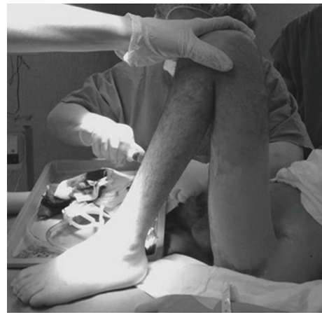
FIGURE 3: Case 4 Preoperative hip flexion contracture.