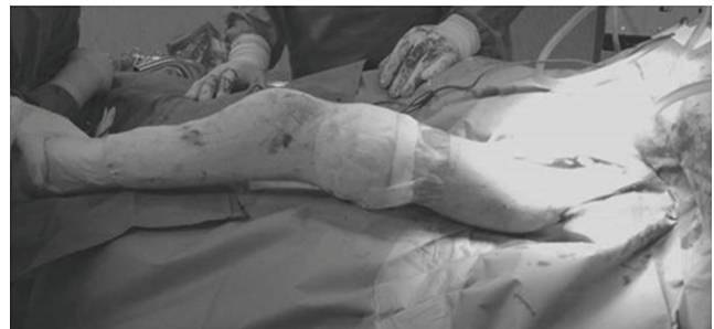
FIGURE 4: Case 4 Postoperative hip flexion.

considered; even if it looks like more demolitive, it has fewer potential complications than arthroplasty (i.e., infection, dislocation, mobilization, etc).