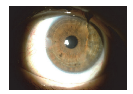
FIGURE 4: Corneal opacification with neovascularization.

later, despite symptomatic improvement, the ocular surface remained quite similar and the patient was treated with topical cyclosporine at the concentration of 0.05%, 1 drop twice daily (twelve hours apart). Ten months after treatment there was an improvement in right eye BCVA (0.8); the slit lamp examination showed bilateral central stromal haze, no keratitis in the right eye, and improvement in the left eye. In the next 3 months there was a worsening of the ocular discomfort and at observation she had a bilateral inferior keratitis with a corneal erosion in the right eye. A temporary lateral tarsorrhaphy was proposed, but the patient refused it. She underwent bilateral lacrimal punctal plugs placement and at the end of the follow-up-6 months after plugs placement—the BCVA was 0.8 in the right eye and 0.6 in the left eye; at slit lamp examination there is no keratitis or corneal erosions and a lower degree of haze and there was some regression of corneal vessels in the left eye. The IOP was 18 mmHg and 16 mmHg, respectively, and fundoscopy was normal.