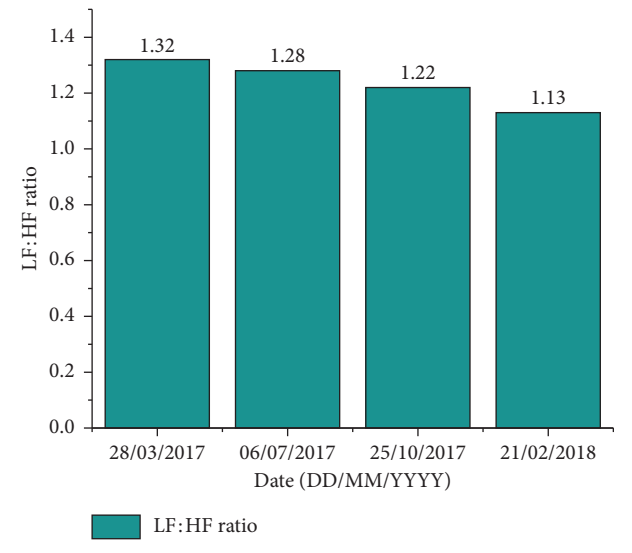
FIGURE 2: Ratio of low frequency (LF) to high frequency (HF) power (LF:HF) heart rate variability after the patient sustained his two mTBI's (September and October 2016).

The two concussions (mTBI) are dated in the table. No HRV data were available on 4-11-2013. ASDNN = average of the standard deviations of all R-R intervals for all 5 min segments in the 24 h recordings; SDANN = standard deviation of all averaged normal sinus R-R intervals for all 5 min segments in the 24 h recordings; SDNN = standard deviation of all normal sinus R-R intervals in the entire 24 h recording. Ultra-low frequency (ULF), 0-0.003 Hz; very low frequency (VLF), 0.003-0.04 Hz; low frequency (LF), 0.04-0.15 Hz; high frequency (HF), 0.15-0.4 Hz; and total frequency (TF), 0-0.5 Hz.